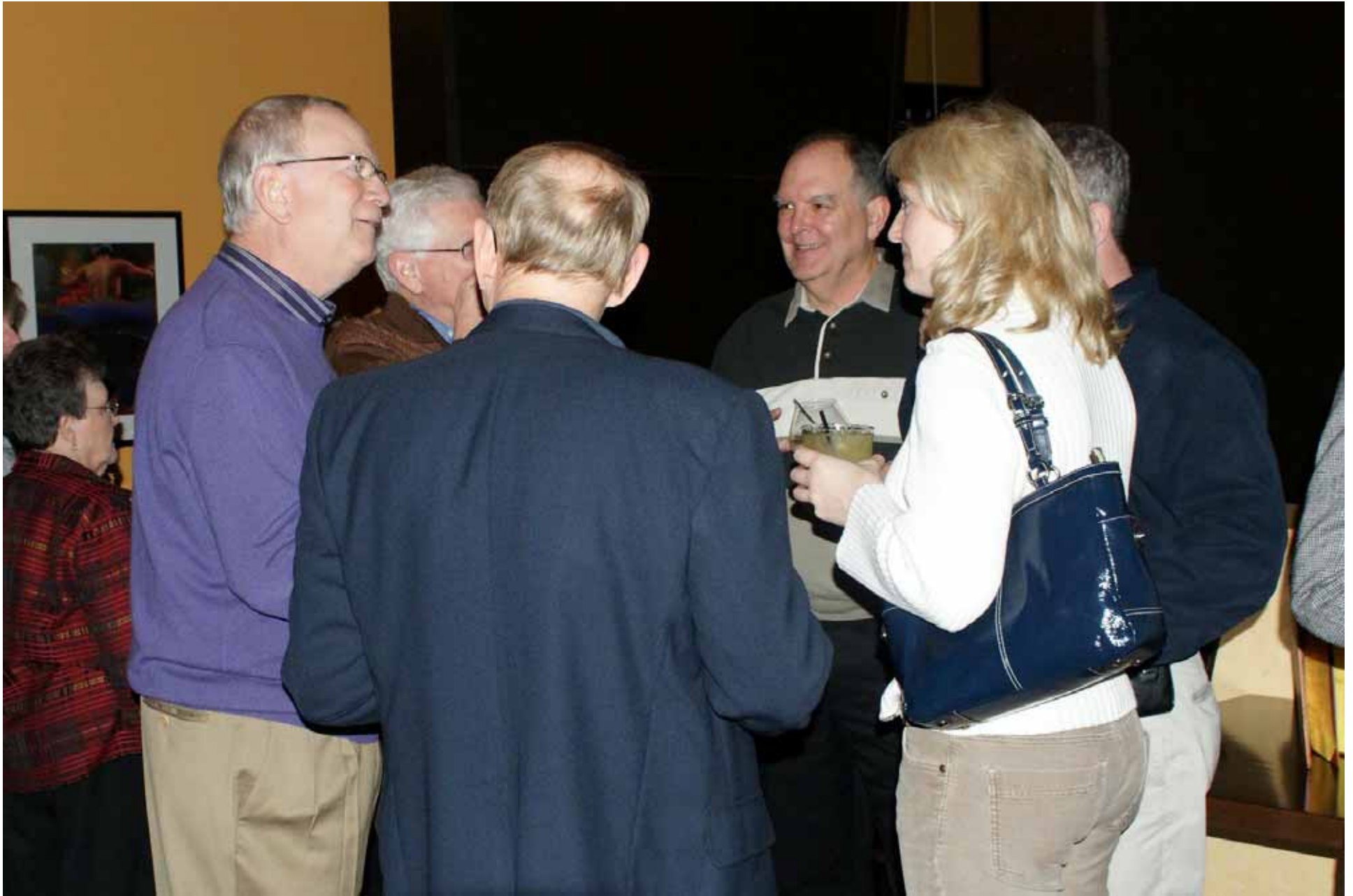
Members had a great time at Wapango Restaurant for our Local Color Night.