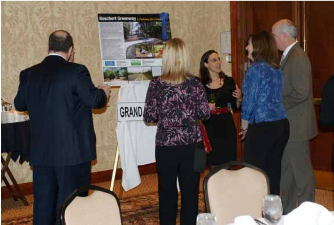
Members mingled during the Design Excellence Reception while reviewing the Engineering Excellence Award Projects.

We had a great turnout for our 2010 Awards Banquet. Awards were given for Distinguished Service and Engineering Excellence.