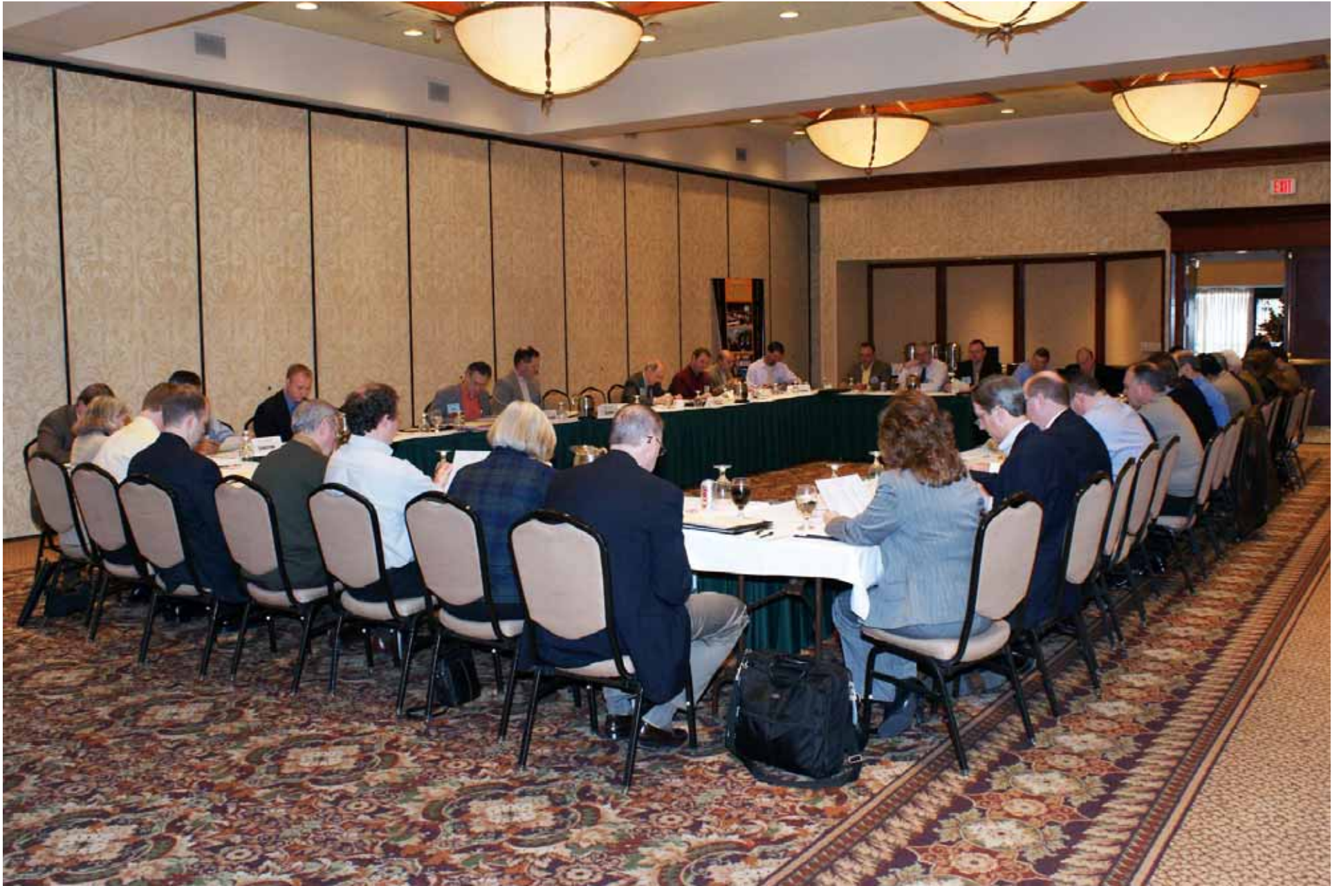
Board of Directors / Membership Meeting